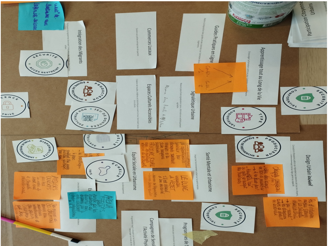
Figure 2 : Example of a portion of the urban data mural realised at La Chapelle Nord (Paris)

The goal was to ensure individual resonance through varied formulations of the cards, addressing the different perspectives of the participants. The workshop facilitated a rich dialogue, with participants actively contributing their insights on their sections of the mural towards the session's end. However, we identified two areas for improvement: the need to create bridges between participants for a more enriched collective reflection, and the provision of accessible data sources. It became apparent that participants were largely unaware of the landscape of major data producers in France and had limited knowledge of potential data sources. Consequently, we are iterating our approach to introduce a set of cards dedicated to leading open data providers such as INSEE, IGN, or Data.gouv, to support the arguments presented in response to urban challenges.