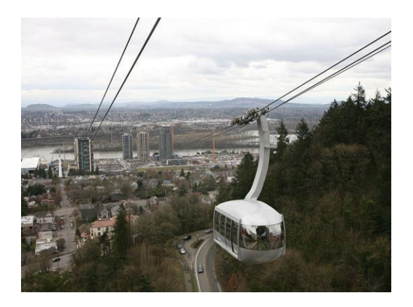
Figure 4: Aerial Tramway Réversible