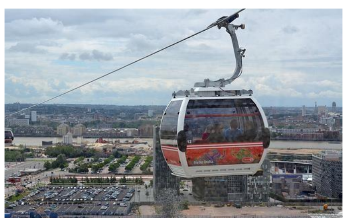
Figure 5: Monocâble détachable Gondoles

A gondola is a cable transport system, including several small cabins (sometimes called "eggs" in France), ranging in size from 2 to 16 seats, arranged on a single cable for water and tractor (called a mono-cable system, as opposed to a bicable cable system) that forms a loop generally unidirectional movement