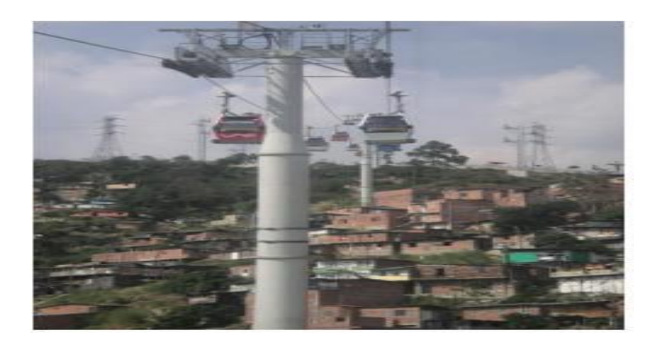
Figure 1: Mono-cable ropeway in Zaragoza-Spain

More people live in urban areas than in rural areas today globally. According to the UN, in 2007, for the first time in history, the global urban population exceeded the global rural population, and the world population has remained predominantly urban thereafter.