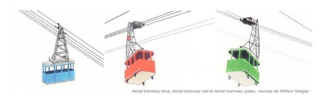
Figure 3: Cable cars designed by William Stiegler

Poland. The first modern modern ski lifts, including the cables are now manufactured entirely inmanufactured in factories, appeared during theindustrial revolution. Until the beginning of the twentieth century, these systems wereonly used for transporting transport of goods, particularly for mining.