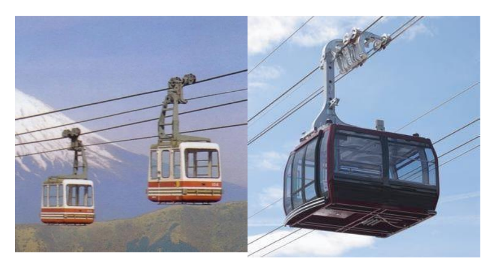
Figure 6: Bicâbles et tricâble détachable Gondola