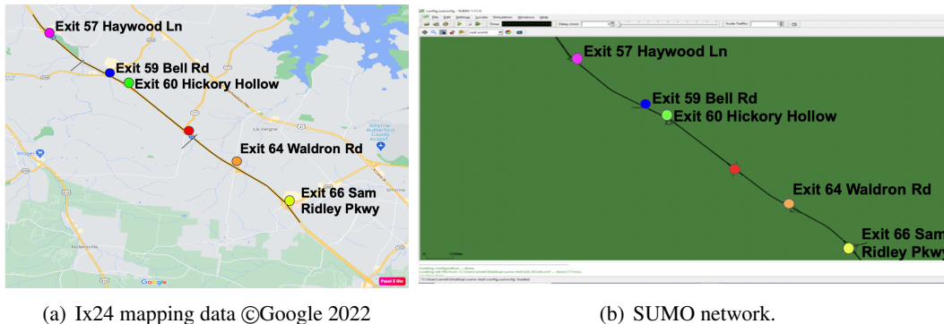
Figure 2: I24 road network.

The proposed methodology is applied to a road network of a portion of I24 highway in Nashville, Tennessee, the U.S., presented in Figure 2. The road network consists of 154 nodes, 452 links, and 16 traffic signals. The flow data set, LOS data and the cycle time of signals are provided by the Tennessee Department of Transportation (TDOT), and the speed data is provided by INRIX company. TDOT flow data corresponds to the network links, while the INRIX data provide the speed for every road segment. One link can consist of more than one road segment, and there is no overlap between road segments and links. The data sets represent the morning peak hour (6:30 am - 8:30 am). 20 min simulation warm-up is considered to insert the agents with their optimal departure times.