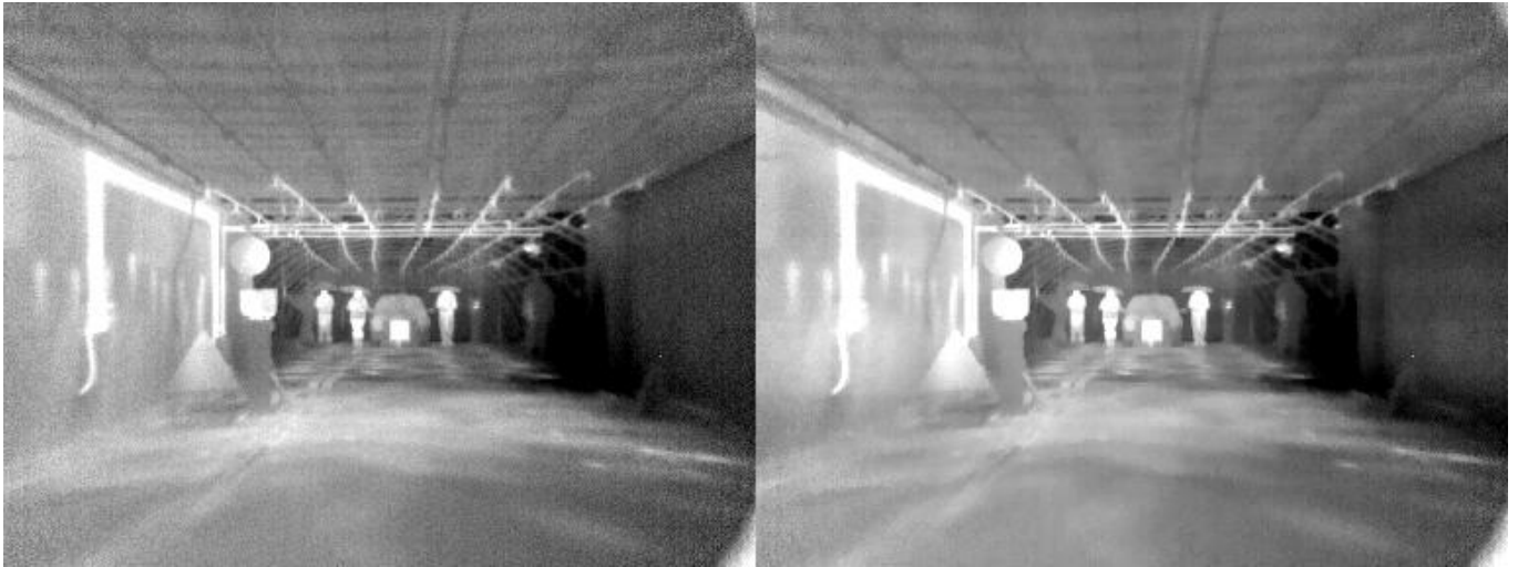
Fig. 5. LWIR image in CEREMA's Fog chamber [10]. On the left is the original image and on the right the restored image.