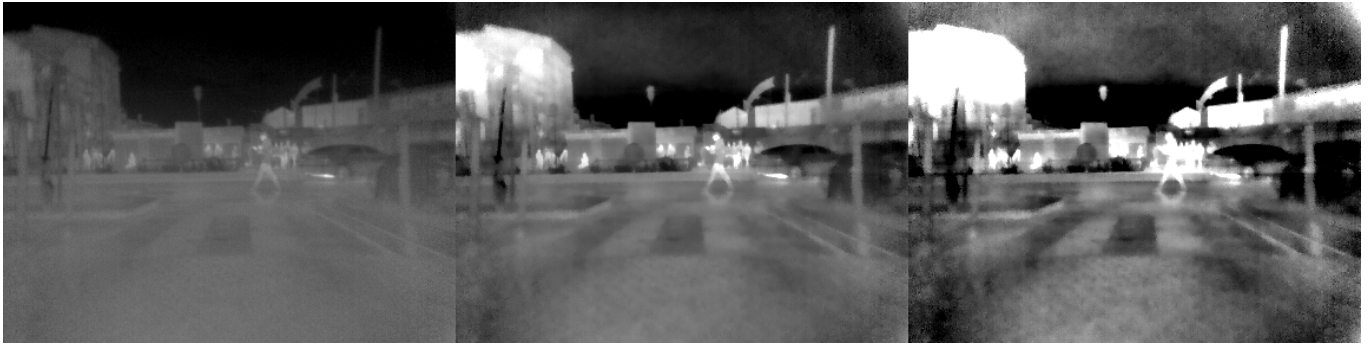
Fig. 7. LWIR image with rain. From left to right, the original image, the image restored with the proposed algorithm and the image enhanced with CLAHE.

Tests on the first dataset have shown that, in bad weather conditions, the noise is high with respect to the signal. The evaluation and comparisons were qualitative since no reference is available. As illustrated in Fig. 4, the proposed algorithm brought better results compared with image enhancement using the Contrast Limited Adaptive Histogram Equalization algorithm (CLAHE [15]): images are less noisy, areas belonging to the same object are more homogeneous, less over-contrasts, background and sky remain separated. This is valid for daylight and night images. We also found that vehicles with high contrast passing through the scene do not affect the global image intensity along the video with the proposed algorithm. This is not the case with CLAHE. Besides, CLAHE is three time slower on average. We also tested the Multiscale Retinex algorithm [17] and observed that it strongly failed to cope with moving vehicles in videos.