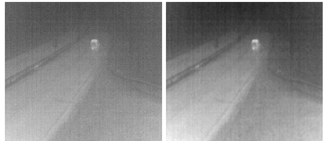
Fig. 3. On the left is an original LWIR image in bad weather and on the right the denoised image after bilateral filtering.

is required. We have implemented the bilateral filter with a constant weight in space and in intensity for 12-bit images. It is thus dedicated to the observed Gaussian noise [16]. We used a window size between 3 to 5 pixels, and an intensity threshold of 10. These values were selected experimentally. Fig. 3 shows the resulting denoising. On the left is the original noisy image during bad weather conditions, in La Fageole pass. On the right is the image after filtering. The filtered image is cleaner and some road signs are now more visible. Nevertheless all noise is not removed, not to remove image details.