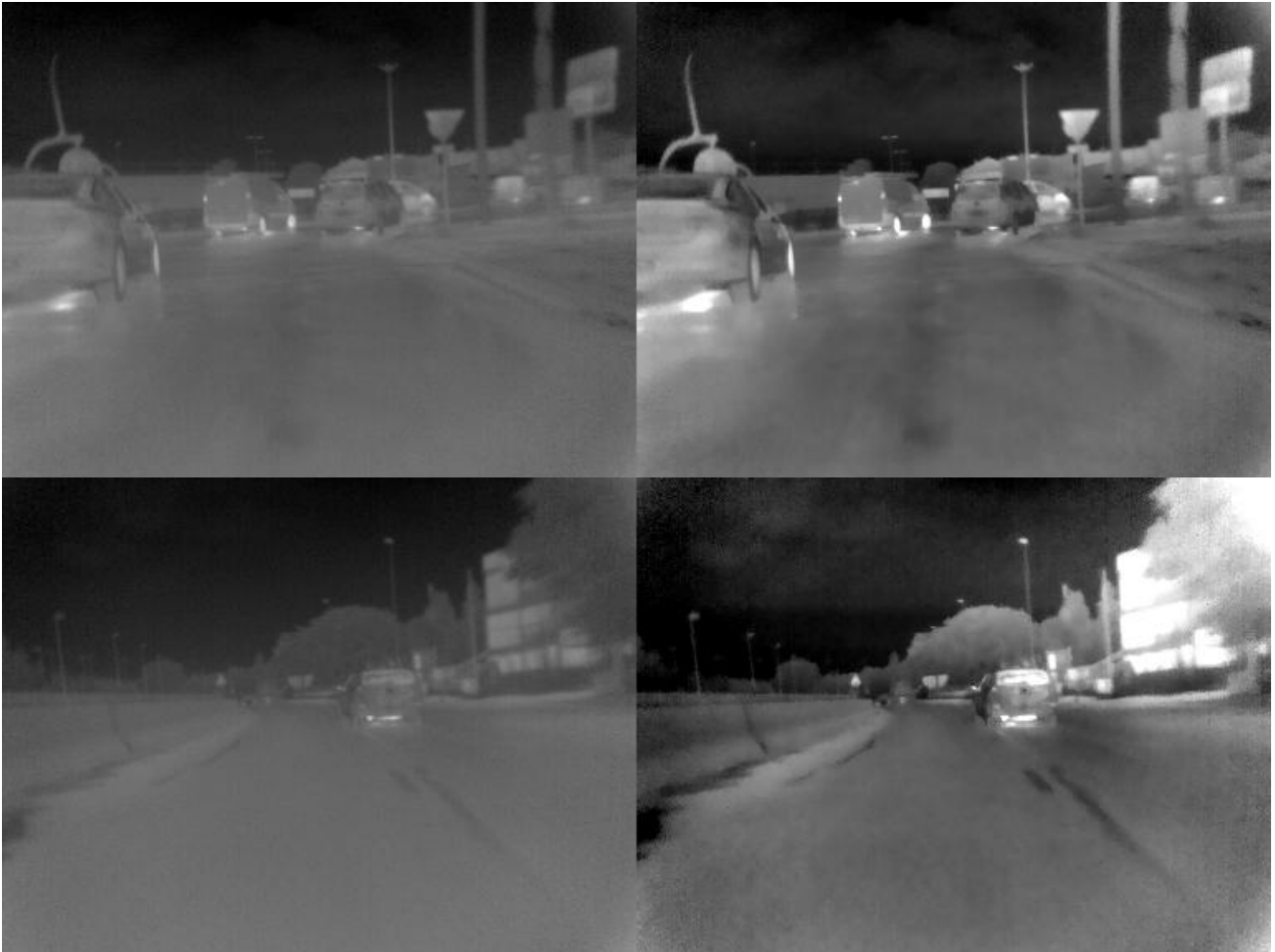
Fig. 8. Examples of LWIR image in bad weather from a camera embedded in a car: original image (left) and restored image (right).