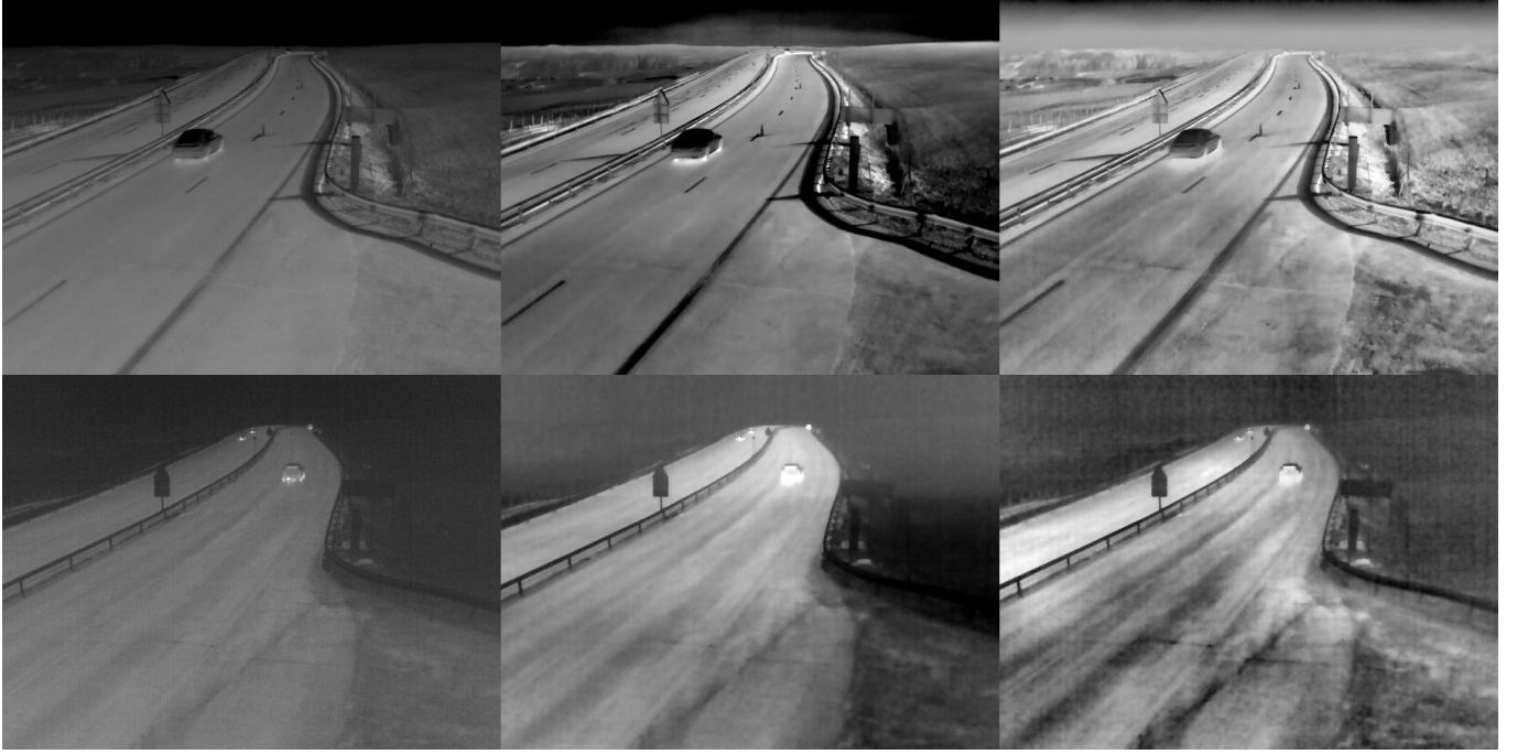
Fig. 4. LWIR images in bright day (top) and in bad weather (bottom), La Fageole pass, France. From left to right, the original image, the image restored with the proposed algorithm and the image enhanced with CLAHE.

air temperature T . This extra term is negligible for outdoor scenes in temperate countries.