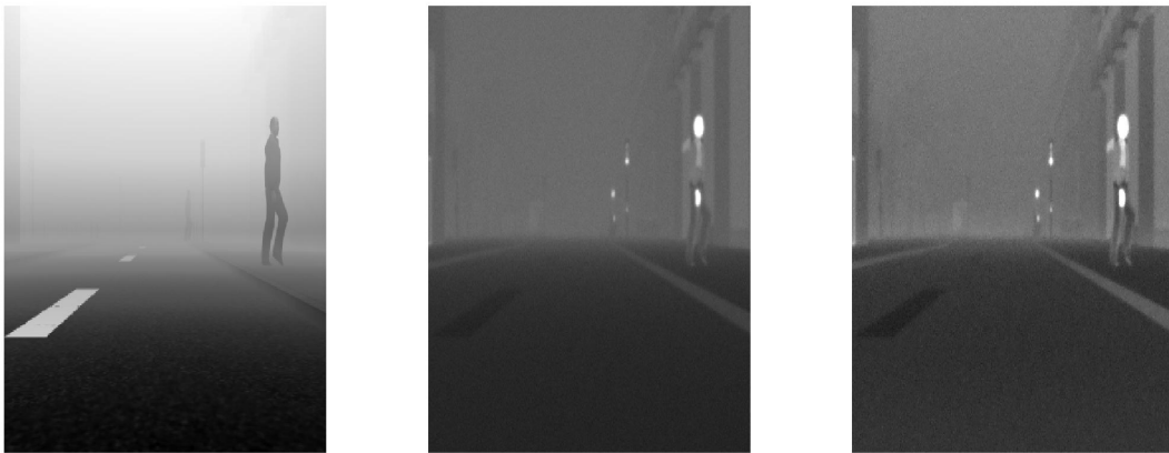
Fig. 6. Simulated LWIR images in dense fog with a visibility range of 30m , by the company OKTAL SE. From left to right: image in visible band, original LWIR image, restored LWIR image.

smoothing with a spatial scale set experimentally to the value 18. A bounding is performed on factors with a difference too large with respect to the smooth factor. This leads to a trade-off between a good restoration and the amplification of the remaining noise.