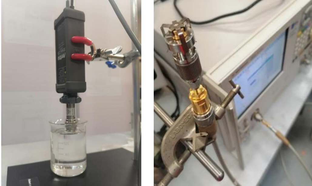
Figure 1: a. Measurement with Probe 1 b. Calibration with Probe 2

value of \epsilon' and \epsilon'' by means of a capacitive model [10]. This probe will be called later as Probe 1. The second one [4] consists on a HP 85070B Hewlett Packard dielectric probe kit connected to an HP network analyser, under control of a personal computer (Figure 1.b). The measurements were carried out by ensuring the contact between the surface of the sample and the probe. The apparatus measures a coefficient of reflection which is converted to \epsilon' and \epsilon'' by a theoretical approach suggested by [11]. This probe will be called Probe 2.