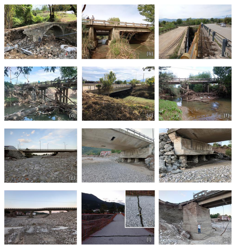
Fig. 1. Photos of the inspected bridges: (a) No. 2; (b) No. 3; (c) No.3A on the left and No. 4 on the right; (d) No. 4; (e) No. 5; (f) No. 6; (g) - (i) No. 7; (j) - (m) No. 8; (n) - (p) No. 9; (q) No. 10; (r) - (t) No. 11; (u) No. 12; (v) - (x) No. 13; (y) No. 14; (z) No. 15.