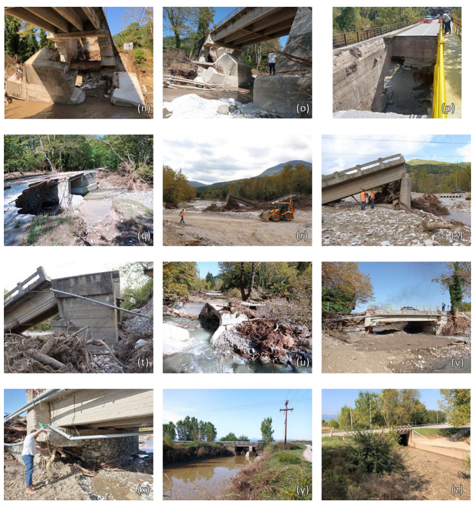
Fig. 1. Continued