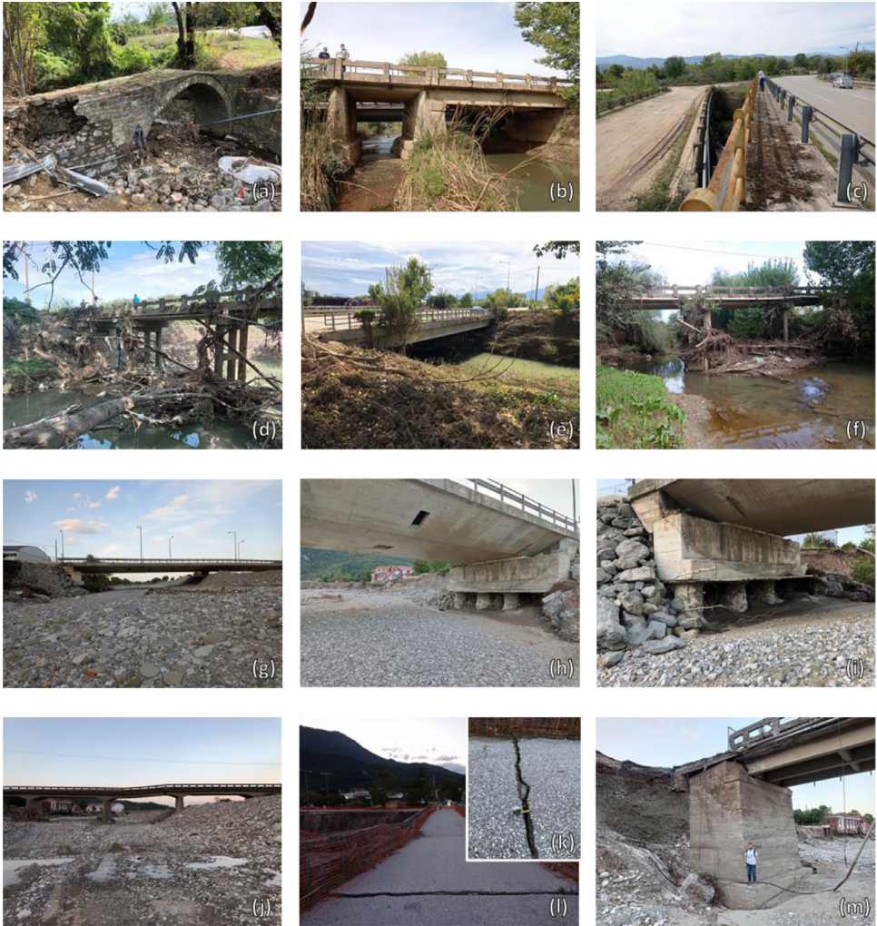
Fig. 1. Photos of the inspected bridges: (a) No. 2; (b) No. 3; (c) No.3A on the left and No. 4 on the right; (d) No. 4; (e) No. 5; (f) No. 6; (g) – (i) No. 7; (j) – (m) No. 8; (n) – (p) No. 9; (q) No. 10; (r) – (t) No. 11; (u) No. 12; (v) – (x) No. 13; (y) No. 14; (z) No. 15.