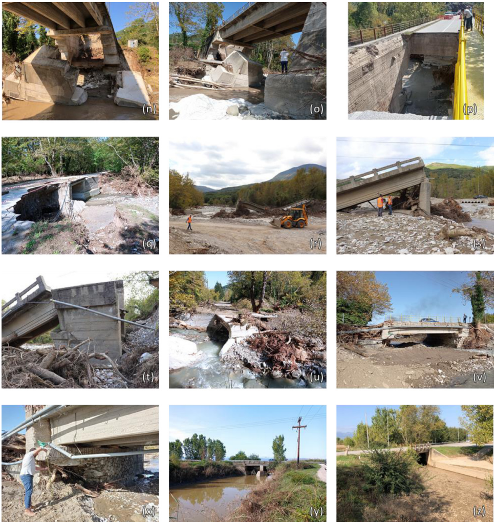
Fig. 1. Continued