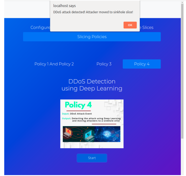
Fig. 2. DL-based DDoS attacks detection and mitigation triggering screenshot.

Fig. 1 shows the base hardware/software resources deployed in our 5G prototype. To emulate the cellular network elements (i.e., the Core Network – CN – and the Radio Access Network – RAN), we use OpenAirInterface (OAI). OAI is an open-source software developed by Eurecom to support mobile telecommunication systems like 4G Long Term Evolution (LTE) and 5G New Radio (NR). To deploy the CN elements, composed in this scenario by the Home Subscriber Server (HSS), the Mobility Management Entity (MME), the Serving Gateway (SGW) and the Packet Gateway (PGW), we use a Dell Precision 3551 laptop, which provides access to the Internet. On the other hand, for